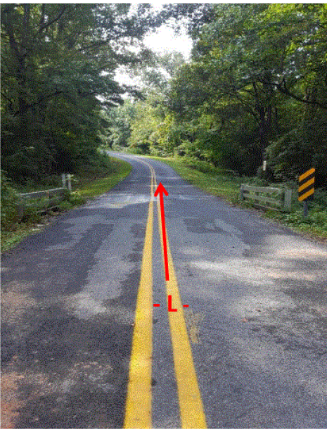
Photograph No. 1: View looking towards EB1 to EB2